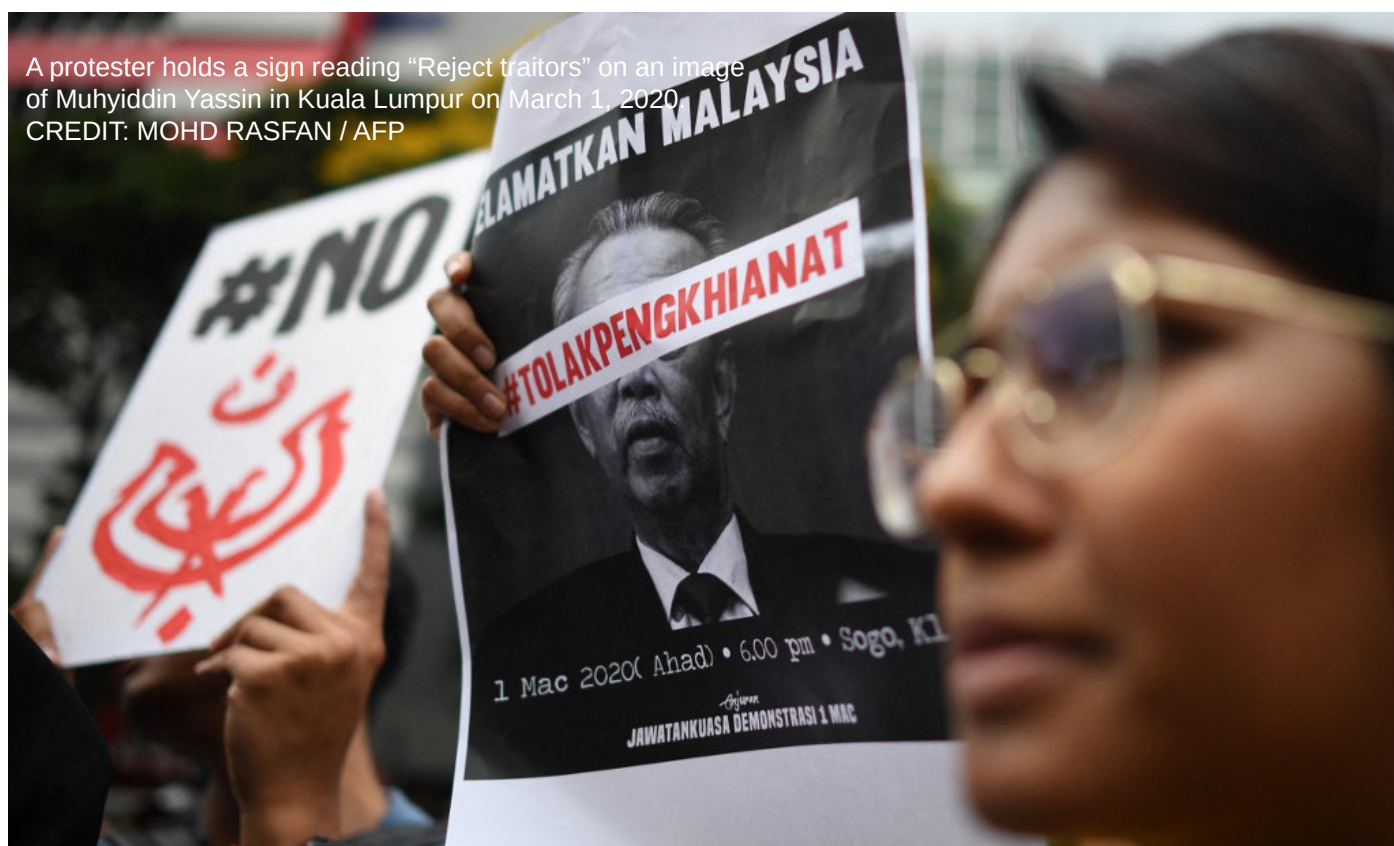
A protester holds a sign reading "Reject traitors" on an image of Muhyiddin Yassin in Kuala Lumpur on March 1, 2020.