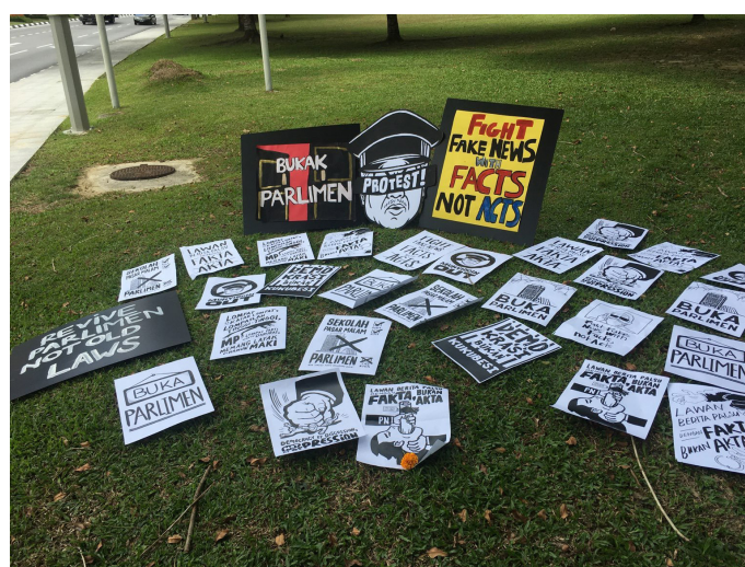
Civil society organisations protest outside Malaysia's Parliament in Kuala Lumpur on 14 March 2021.

If the current wide-ranging laws are not repealed, or at very least amended to be less expansive and thus open to abuse or misapplication, it is quite likely that Malaysia's repressive attitudes towards media freedom will continue well into the Perikatan Nasional administration's tenure.