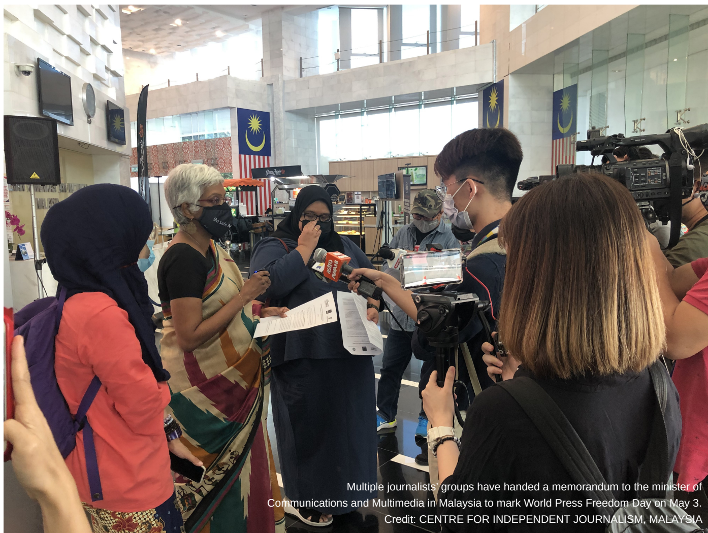
Multiple journalists' groups have handed a memorandum to the minister of Communications and Multimedia in Malaysia to mark World Press Freedom Day on May 3.