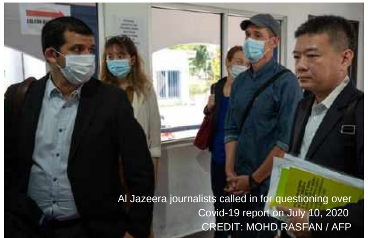
Al Jazeera journalists called in for questioning over Covid-19 report on July 10, 2020