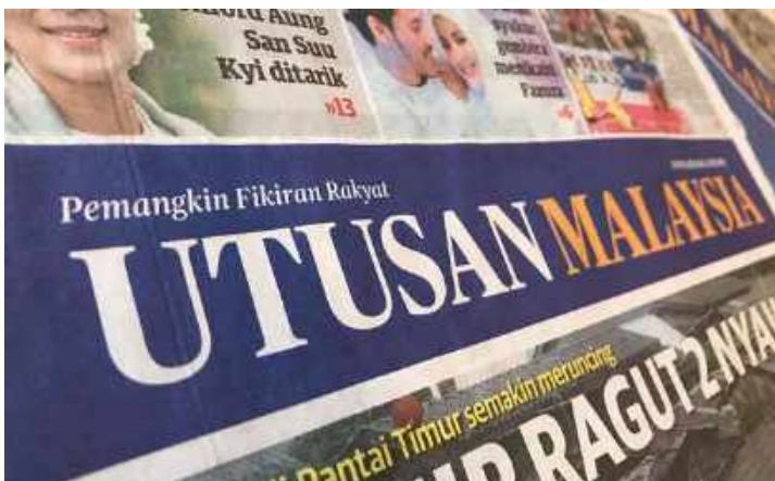
Utusan Malaysia ceased operation in October 2019 leaving more than 800 workers jobless.

Tamil Nesan ceased total operations on February 1, 2019 after 94 years of business. The newspaper, owned by the family of former Malaysian Indian Congress president Tun S Samy Vellu, is said to have faced financial problems in the last ten years. It was reported that 45 staff were issued termination letters.